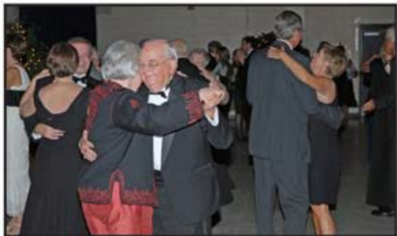
Dancing The Night Away