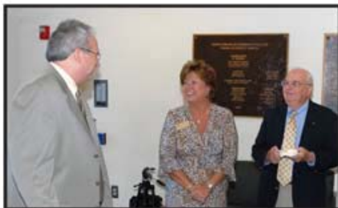
Franklin Campus Celebration