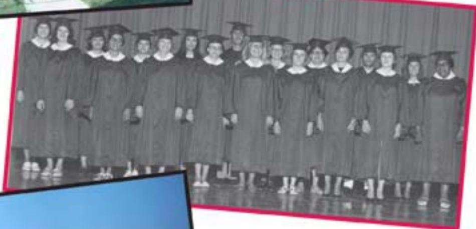
RIGHT: VCTI held its first commencement ceremony for 21 adult high school graduates in 1970.