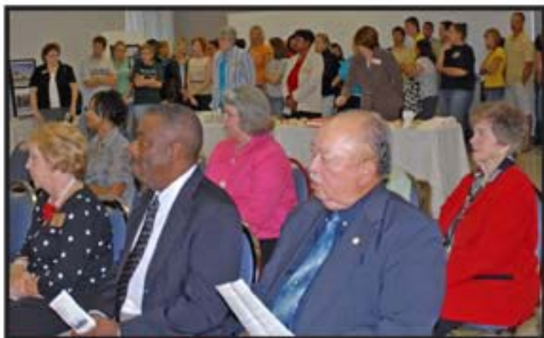
South Campus Celebration