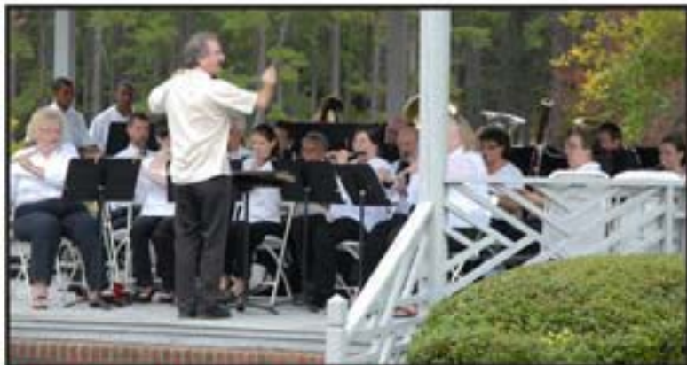
Vance-Granville Community Band