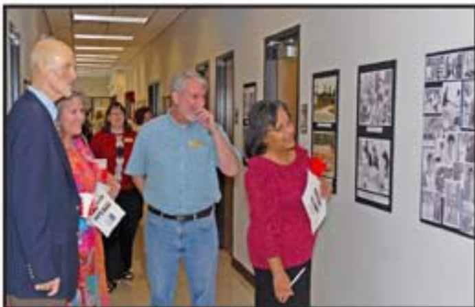
The Hall of History