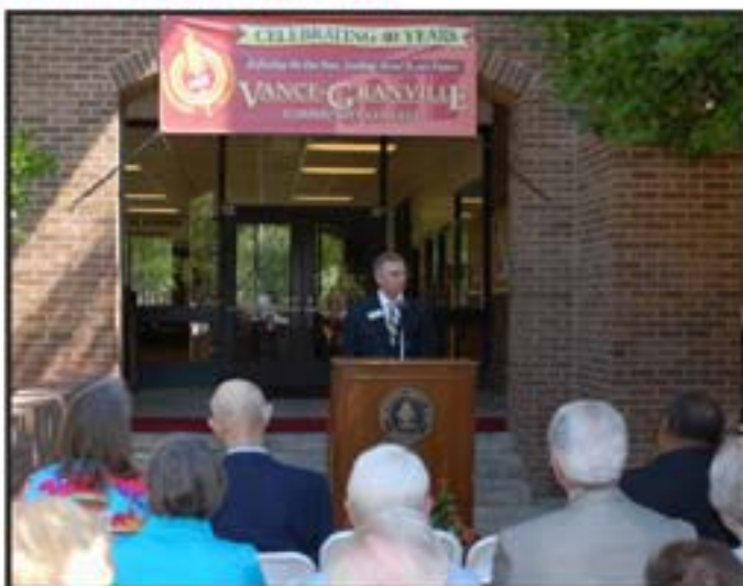
Re-dedication of Main Campus