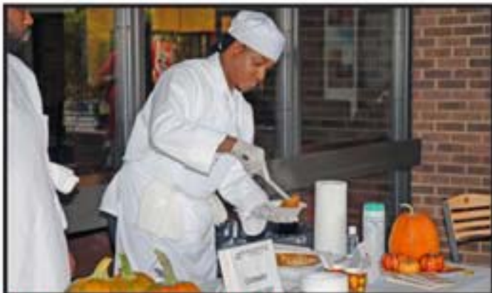
Culinary Students Chili Cook-off