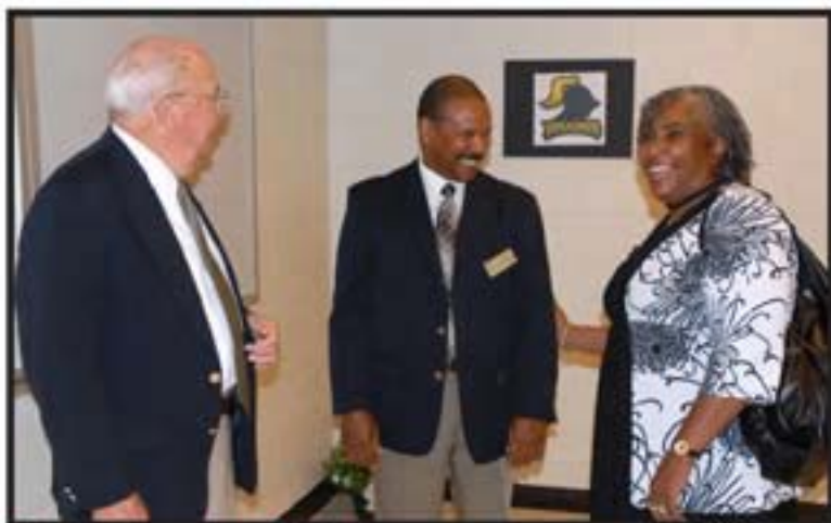
Warren Campus Celebration