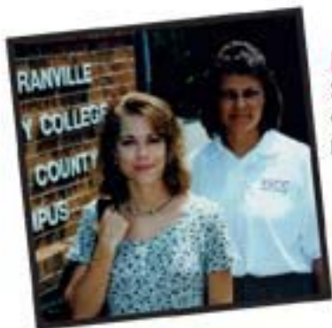
RIGHT: In 1998, Franklin County Campus moved into its permanent home, which gained a Biotechnology Lab in 2001.