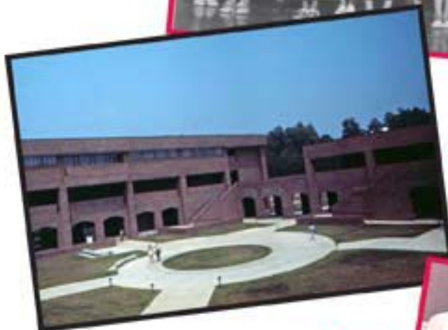
LEFT: VGCC's Main Campus opened in 1976, just as the institution obtained community college status.