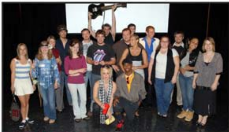
Student Fashion Show