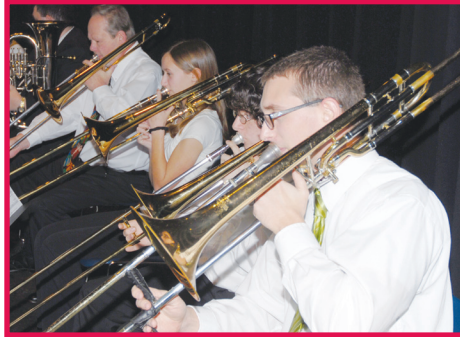
The VGCC community band entertained hundreds of area residents with numerous concerts during the 2008-2009 year.