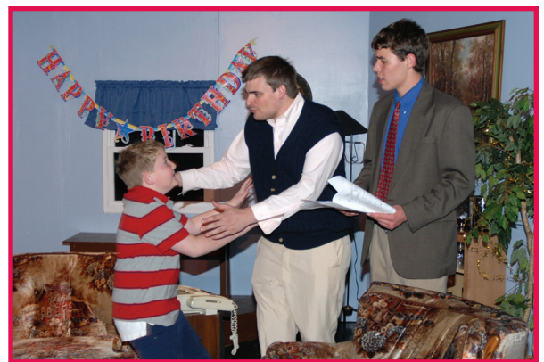
Following the success of "Harvey," drama students performed the comedy, "The Nerd."