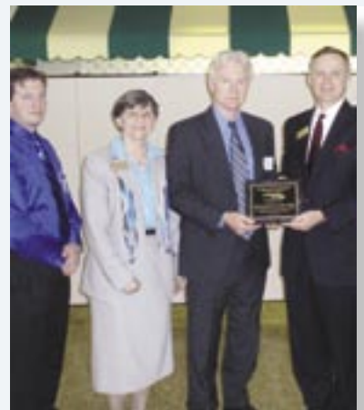
Federal Bureau of Prisons