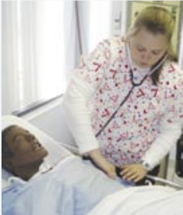
Maria Parham Medical Center

10 — Partnerships Empowering Education —