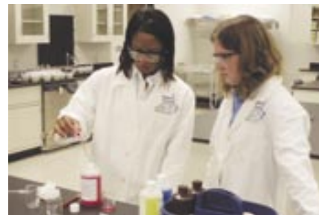
Bioprocess Technology students work in the new 3,100-square-foot laboratory located on Main Campus.