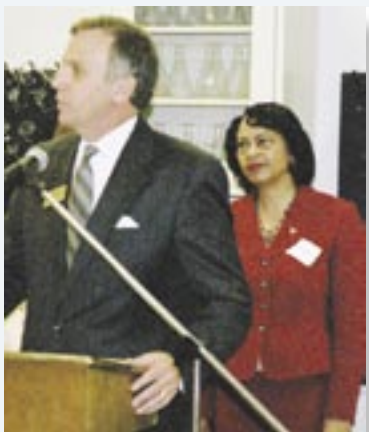
N.C. Central University