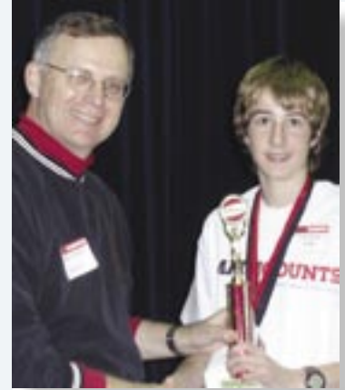
Professional Engineers of NC