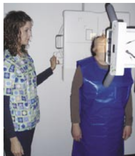
Radiography students work in the lab at South Campus.

stations, a prep room and storage room. Grants from the NC Bionetwork helped pay for video-conferencing equipment, a fermenter with controls, autoclave, incubator, centrifuges and DNA and protein gel electrophoresis equipment.