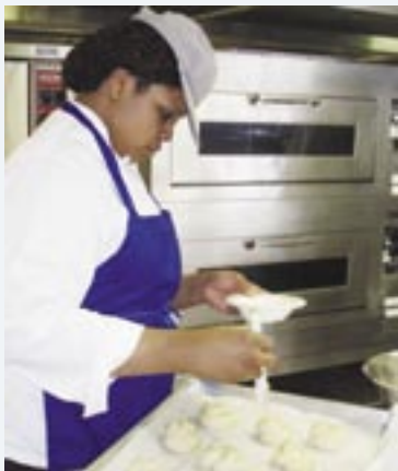
Masonic Home For Children