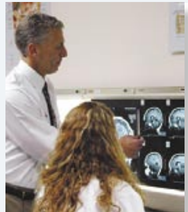
Edgecombe Community College